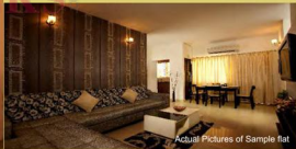
Actual Pictures of Sample flat